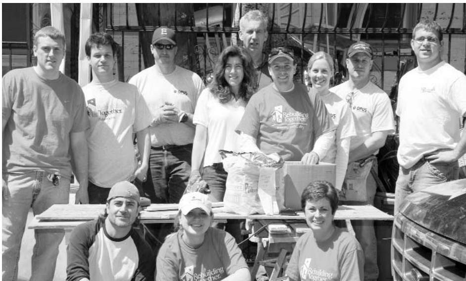
Opus East, LLC employees and Gung Ho! teamed up in 2007