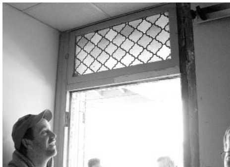
Original architectural elements are still very much a part of homes in Norristown.

Liberty Mutual Surety employees and congregants from Epiphany of Our Lord, Plymouth Meeting have been a significant team of volunteers with RTP for the past ten years, helping more than two dozen homeowners. For the past six years, they have chosen to concentrate their efforts in Norristown in order to have a positive impact on communities in need close to where the volunteers live, work, and worship. The team is helping two homeowners in Norristown this year.